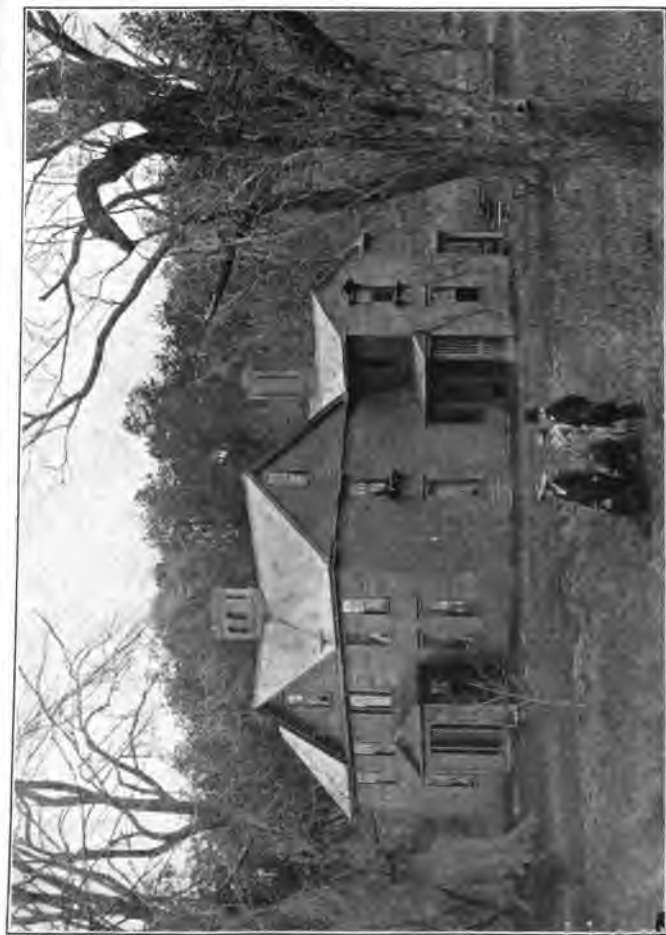
ORCHARD HOUSE AT CONCORD, MASSACHUSETTS